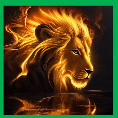
KS 2 story

'Not any more' said the deer- 'its mine' and I am now the princess. You have lost your powers. The girl was so upset and just sat and cried- even her favourite book could not cheer her up.