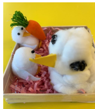
Under all the cotton wool is an egg!