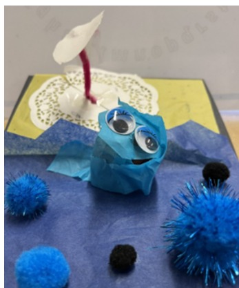
Nyara, from Elm, worked hard creating a mythical sea creature and in the background you can see the beach and parasol.