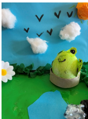
Can you spot the frogspawn?