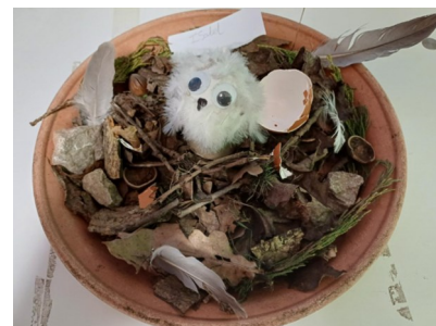
Isabel (Chestnut) has created a nest with a little hatching.