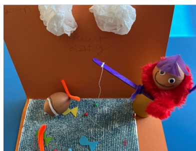
Tymon, from Redwood, has made a fisherman trying to catch an egg fish in lovely sparkling water.