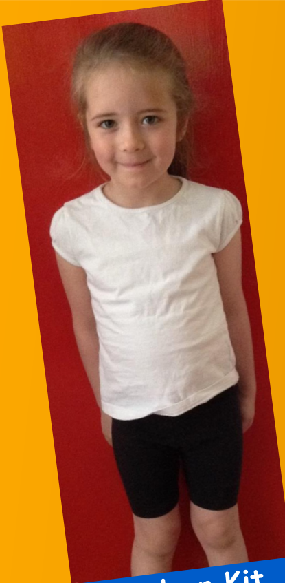
Indoor Kit ✓ White T Shirt ✓ Black/Navy shorts