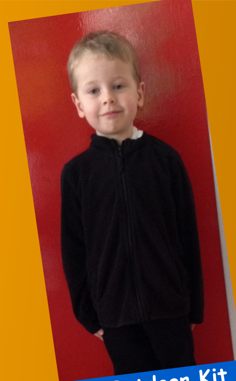
Outdoor Kit ✓ White T Shirt ✓ Black jumper/tracksuit top. (No hood) ✓ Black Tracksuit bottoms /Joggers. ✓ Trainers

You will find out the days when you have PE on your first day back!